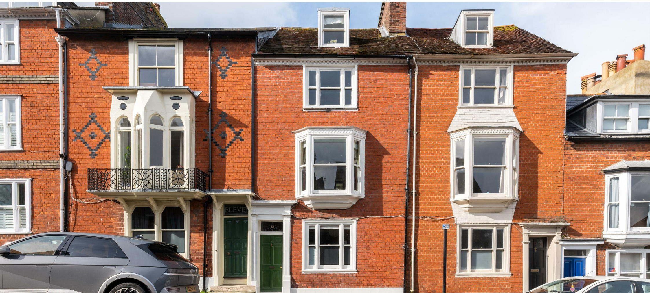
East Street, Lewes